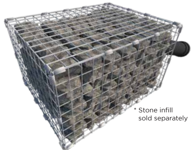
* Stone infill sold separately

Typical Applications - 100mm pipe inlet and outlet: